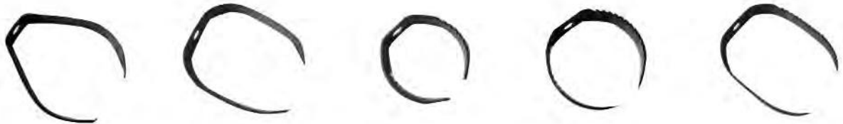
PEAR SHAPE SHARPENED B08 \frac{3}{4}'' \times 3'' U-SHAPE SHARPENED B09 \frac{3}{4}'' \times 4'' FULL CIRCLE TIGER B10 \frac{3}{4}'' \times 2\frac{1}{2}'' FULL CIRCLE TIGER B11 \frac{3}{4}'' \times 3'' U-SHAPE TIGER B12 \frac{3}{4}'' \times 4''