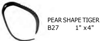
PEAR SHAPE TIGER B27 1'' \times 4''