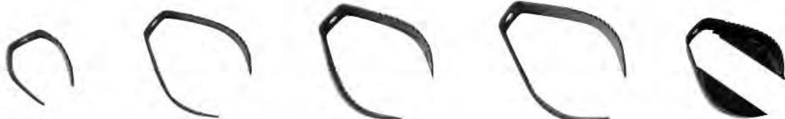
PEAR SHAPE TIGER B13 \frac{3}{4}'' \times 2'' PEAR SHAPE TIGER B14 \frac{3}{4}'' \times 3'' PEAR SHAPE TIGER B15 1'' \times 3'' PEAR SHAPE TIGER B16 1'' \times 4'' GREASE BLADES B17 1'' \times 3'' B18 1'' \times 4'' B28 1'' \times 3'' B29 1'' \times 4''