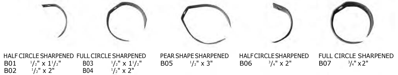
HALF CIRCLE SHARPENED B01 \frac{1}{2}'' \times 1\frac{1}{2}'' FULL CIRCLE SHARPENED B03 \frac{1}{2}'' \times 1\frac{1}{2}'' PEAR SHAPE SHARPENED B05 \frac{1}{2}'' \times 3'' HALF CIRCLE SHARPENED B06 \frac{3}{4}'' \times 2'' FULL CIRCLE SHARPENED B07 \frac{3}{4}'' \times 2'' B02 \frac{1}{2}'' \times 2'' B04 \frac{1}{2}'' \times 2''