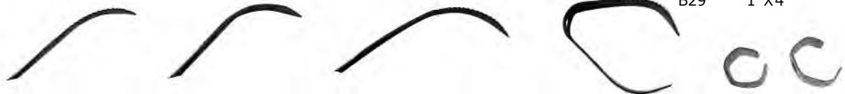
SINGLE KNIFE TIGER B19 \frac{3}{4}'' \times 4'' SINGLE KNIFE SHARPENED B21 \frac{3}{4}'' \times 4'' SINGLE KNIFE TIGER B23 \frac{3}{4}'' \times 3'' PEAR SHAPE TIGER B26 1'' \times 3'' SPARTAN STYLE B31 \frac{1}{2}'' \times 1'' B20 \frac{3}{4}'' \times 6'' B22 \frac{3}{4}'' \times 6'' B24 \frac{3}{4}'' \times 4'' B25 \frac{3}{4}'' \times 6''